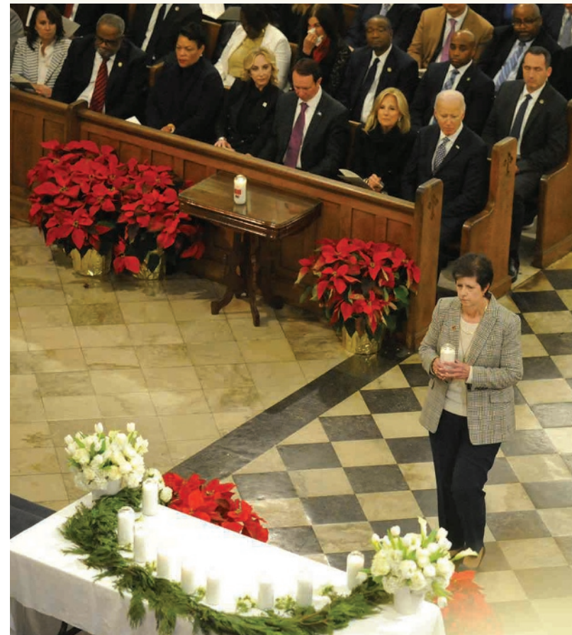
Cynthia carries a candle during an interfaith prayer service for the victims of the Bourbon Street attack.

Catholic Charities Archdiocese of New Orleans